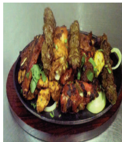
Tandoori Charcoal Oven